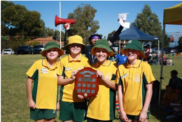
Faction Cross Country